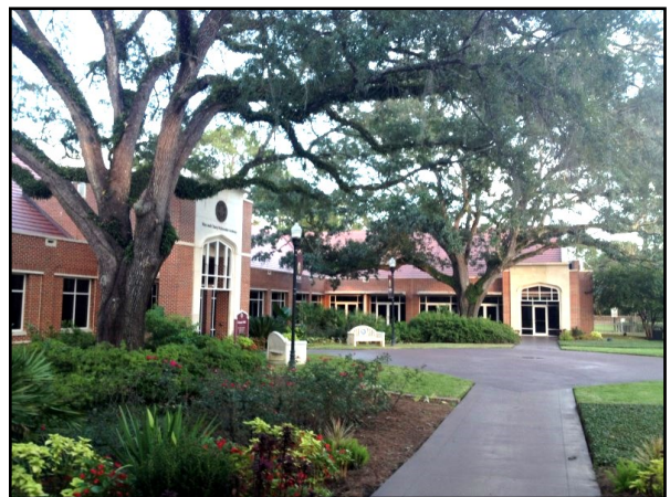
FSU Alumni Center

(Free parking will be available at Alumni Center)